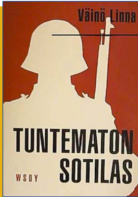
The Unknown Soldier