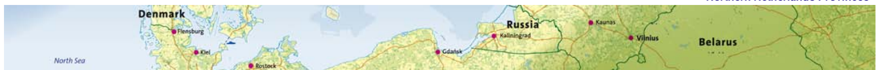
Northern Netherlands Provinces