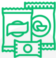
Packaged ambient, chilled and frozen food