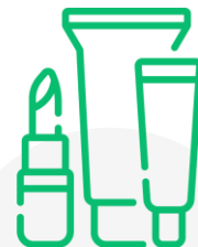
Beauty and personal care