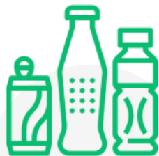
Packaged ambient and chilled drinks